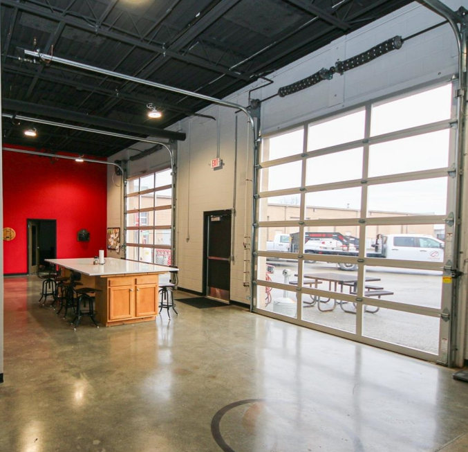
Kitchen Area & Overhead Doors